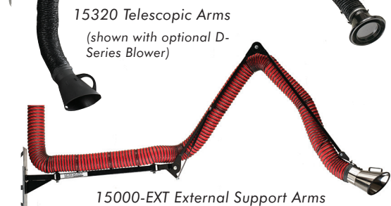
15320 Telescopic Arms (shown with optional D-Series Blower)