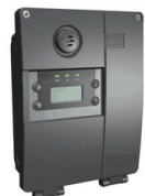
CO, NO 2 FUME DETECTION