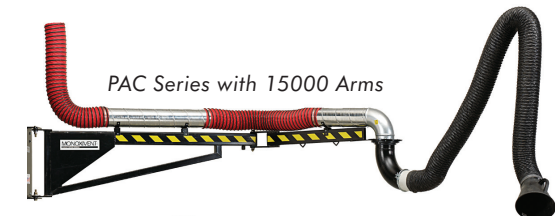
PAC Series with 15000 Arms