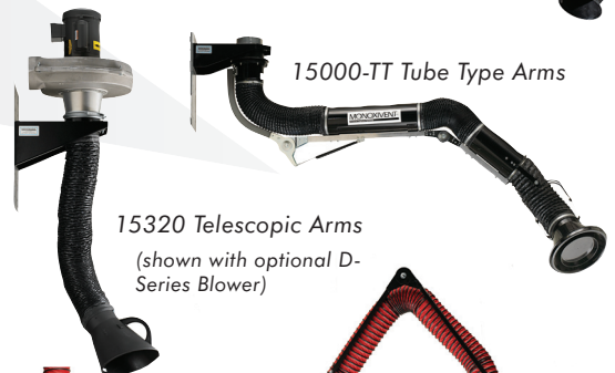
15000-TT Tube Type Arms