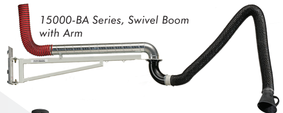
15000-BA Series, Swivel Boom with Arm