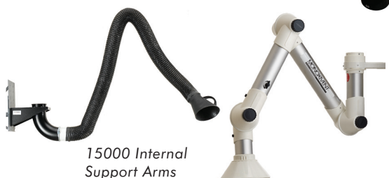
15000 Internal Support Arms